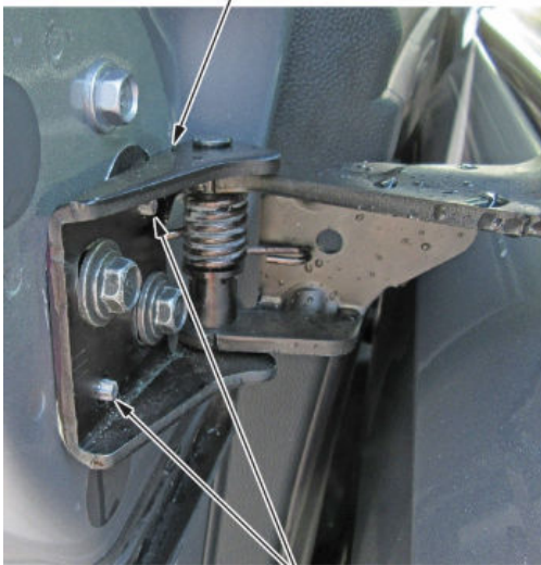
ADJUSTMENT PINS Turn counter-clockwise 2-3 turns. Do not remove.