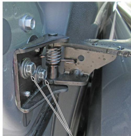
CENTER ROLLER BOLTS Loosen.