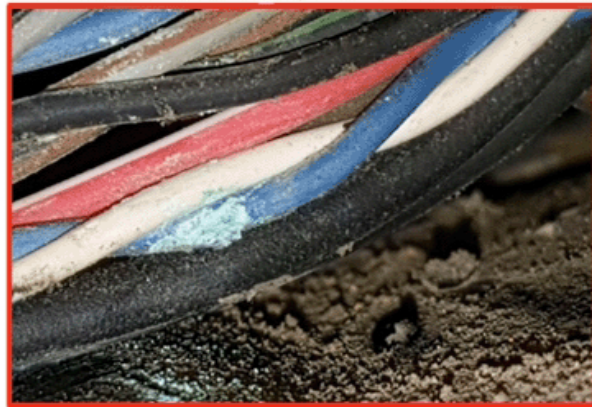
• Frame/Leaf Spring Support Bracket