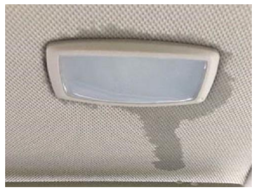
Figure 1: Example of water leak coming from the front vanity light.

Water leak is due to poor adhesion of the sunroof body side seal to the body.