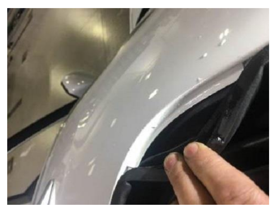
Figure 2: Example of the sunroof body side seal not having proper adhesion to the body.