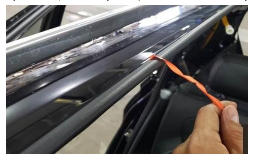
Figure 6: Example of removing the "red" protective tape after seal has been properly seated.

Figure 5: Example of installing the body side seal WITHOUT removing the "red" protective tape.