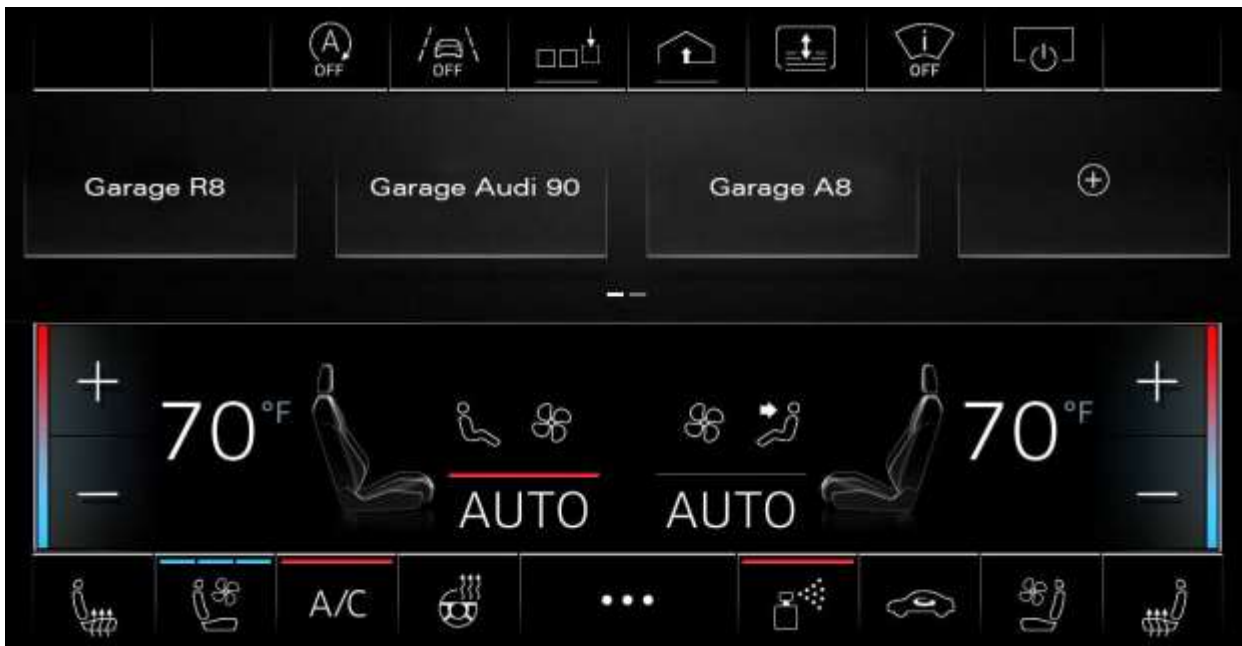
Figure 2. Homelink Buttons In Lower MMI Display – System With Virtual Buttons.