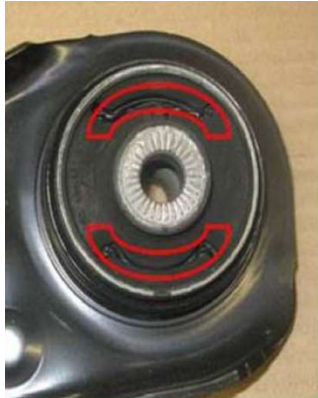
Figure 3. Lithium grease is applied on the red highlighted area only.

The lithium grease must only be applied to the areas shown in red (Figure 3).