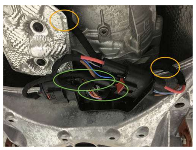
Figure 1. Common positions for harness damage.