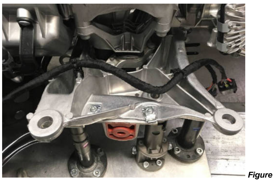
6. Routing and mounting of the transmission harness behind the cross member.

The cross-member is shown dismounted in Figure 6 to show the new mounting points more clearly.For mounting and installation of the new transmission harness, the cross-member does not have to be disassembled.