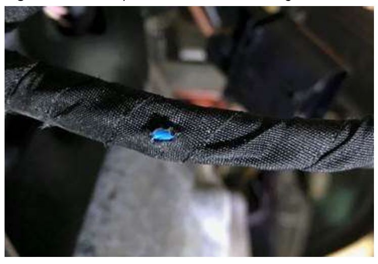
Figure 2. Example of a small rip in the protective tape.