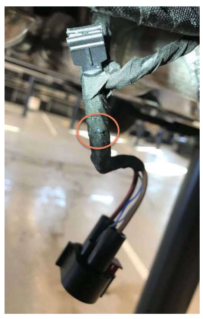
Figure 3. The damage in the harness might be difficult to spot.