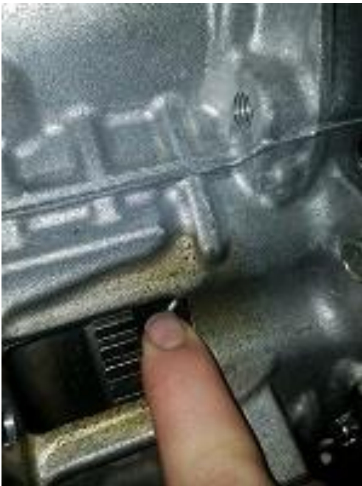
Figure 2: Not seated properly, gap to great