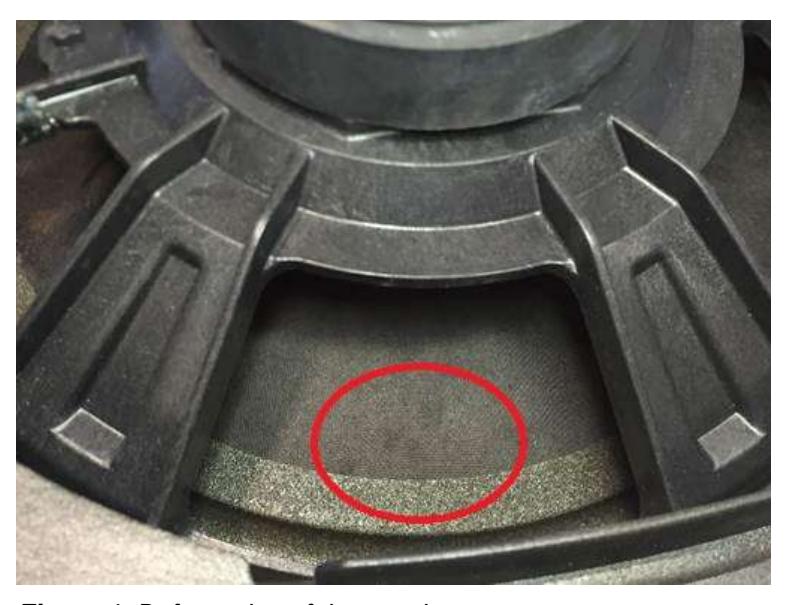
Figure 1. Deformation of the speaker cone.

Water coming into contact with the speaker cone causes a deformation of the cone. This deformation allows the voice coil to come into contact with the magnet of the speaker, resulting in unwanted noises (Figure 1).