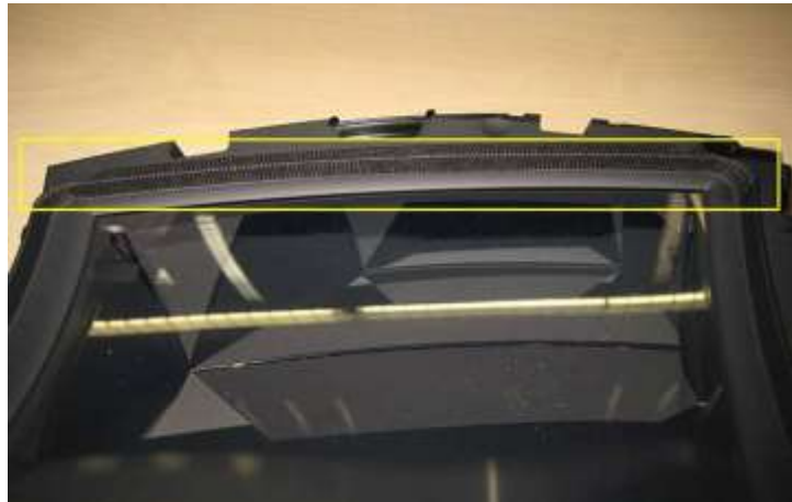
Figure 1. Placement of textile tape.

Cover the trim of the head-up display with textile tape (part number D 373125A2), as shown (Figure 1). Ensure that the tape completely covers the edge of the trim.