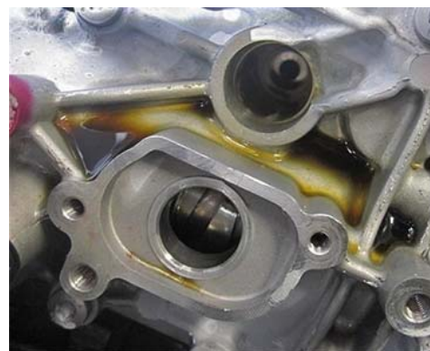
Fault type 2: Cylinder head cover leaking

2.8 To install a new seal on the cylinder head cover, see ⇒ Workshop Manual '158219 Removing and installing cylinder head cover (V6 turbo)' .