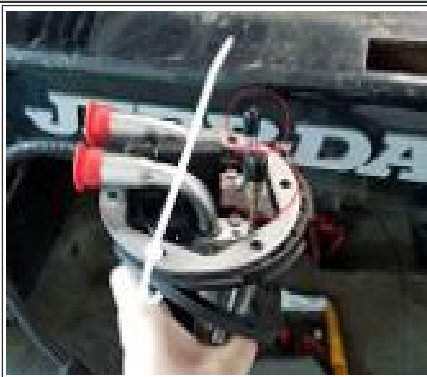
Figure 5: DEF tube orientation of 5/15 gallon ultrasonic sensor

Table 3 below is the comprehensive list of kits that should be ordered for 5 and 15 gallon DEF tanks ONLY when converting from float and optical DEF head unit to ultrasonic DEF head unit. Use the table appropriately to find the correct part number to order.