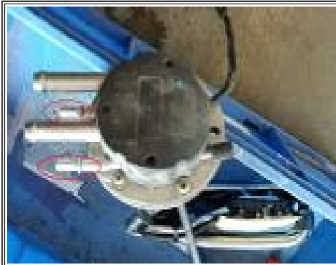
Figure 4: DEF tube orientation of 5/15 gallon float/optical sensor

If a float and optical DEF head unit is replaced with an ultrasonic DEF head unit on 5 and 15 gallon tanks, the DEF lines MUST be replaced. Without replacing the DEF lines, the DEF head unit will not fit in its original location due to different DEF supply and return tube orientation. Refer to Images 4 and 5 below to see the differences in DEF tube orientation.