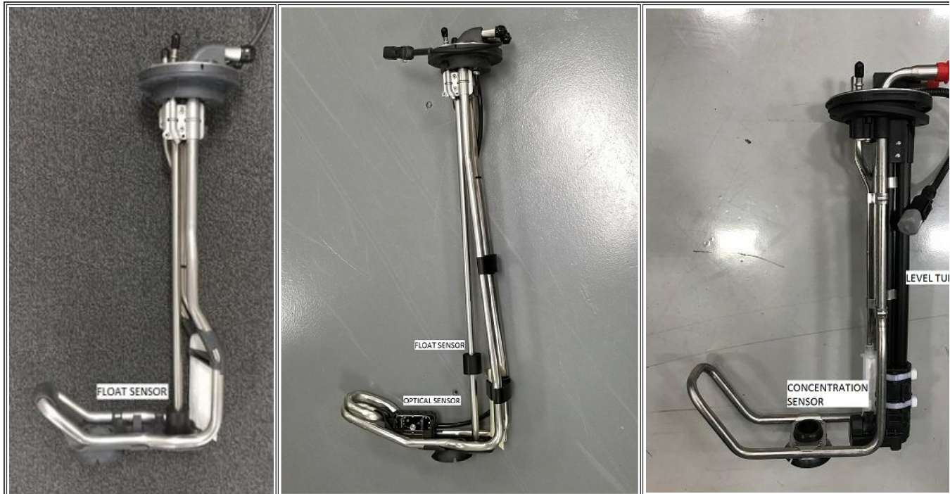
Figure 1: Float ONLY DEF Head Unit (FLS)

The current style DEF head unit has a float to measure the level and an LED to measure the DEF quality, shown in Figure 1 and 2 below. The NEW style DEF head unit uses only ultrasonic waves to measure the level and DEF quality, shown in Figure 3 below.