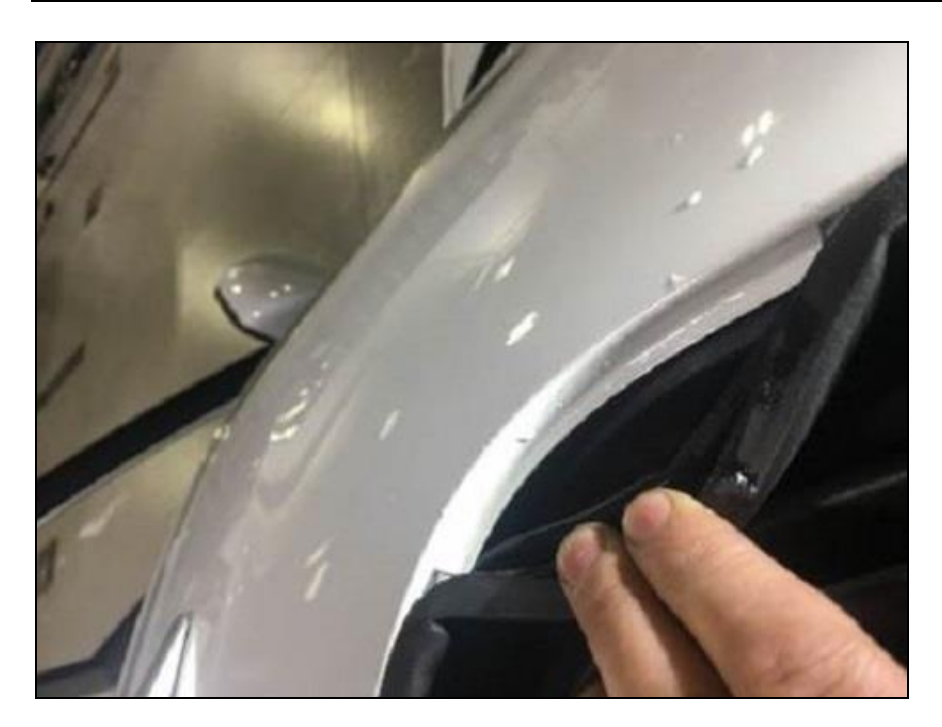
Figure 2: Example of the sunroof body side seal not having proper adhesion to the body.