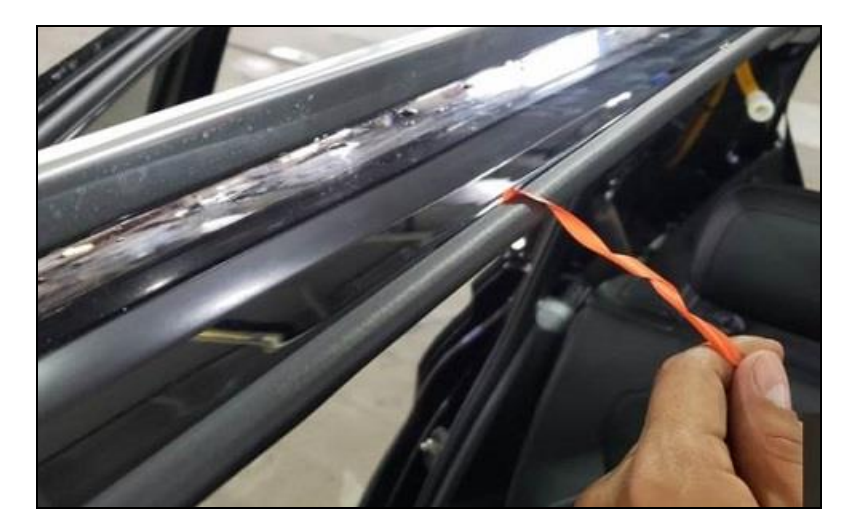
Figure 6: Example of removing the "red" protective tape after seal has been properly seated.

• Continue with the Repair Manual instructions in Elsa to complete the repair.