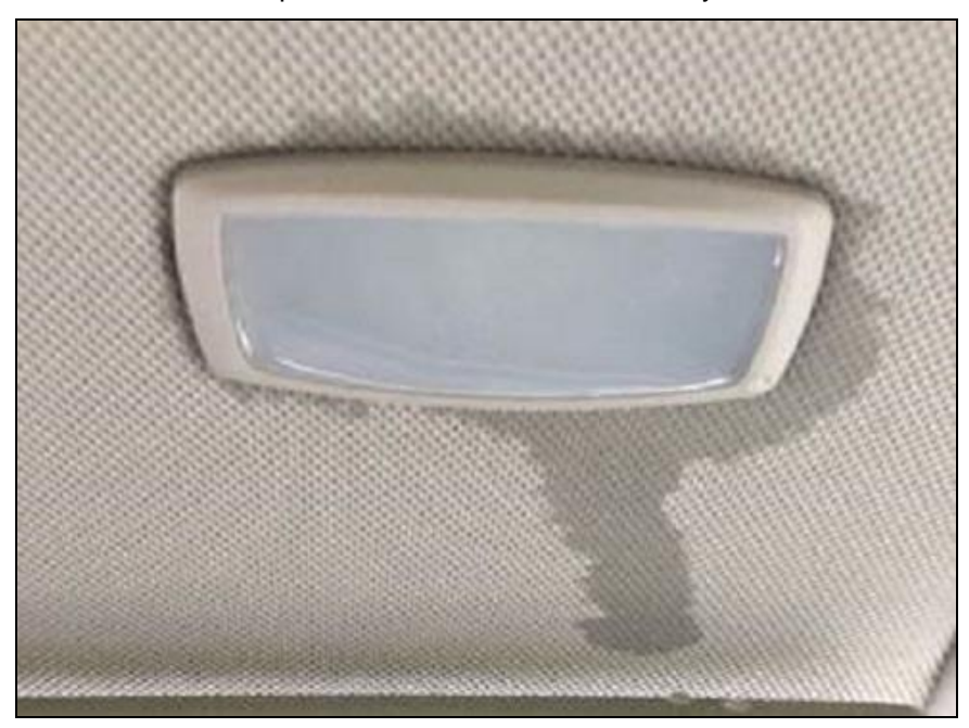
Figure 1: Example of water leak coming from the front vanity light.

Water leak is due to poor adhesion of the sunroof body side seal to the body.