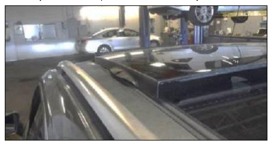
Figure 3: Example of the sunroof panel molded seal warped/deformation.

Visually ensure sunroof panel molded seal and body side seal have no deformation.