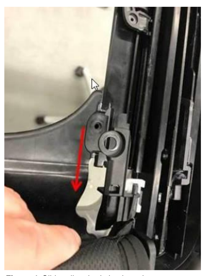
Figure 4. Slide roller shade backward.

Remove the roller shade by sliding it backward and clean the mounting points as shown in Figure 4 and 5. Use the cleaning solution D 009 404 04.