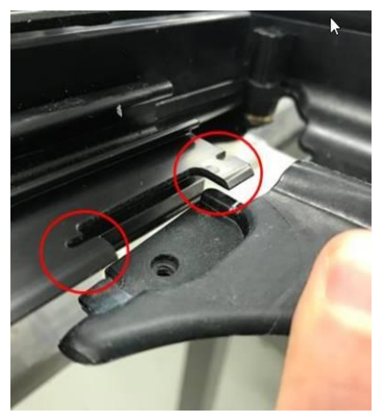
Figure 5. Removing the roller shade.