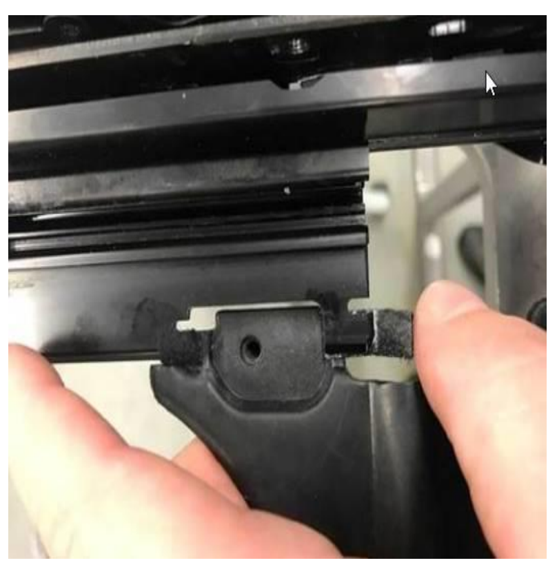
Figure 6. Applying felt tape.

5. Push down on the roller shade pan and starting from the bottom of the guide rail, apply the 1mm thick felt tape and fold them forward and over to the top of the guide rail (Figure 6 and 7).