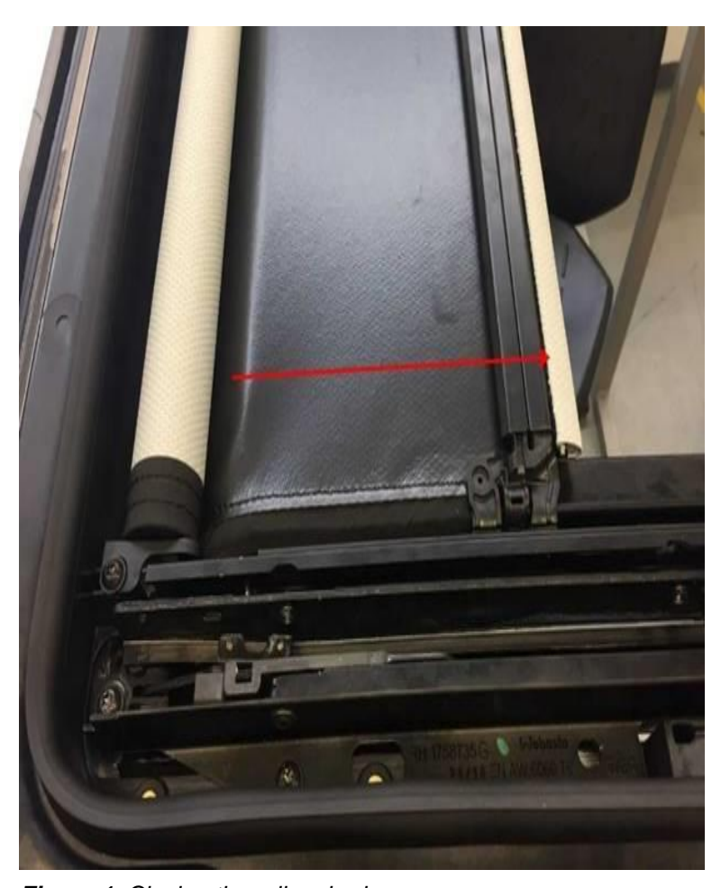
Figure 1. Closing the roller shade.

2. Close the roller shade by about 20cm (Figure 1).