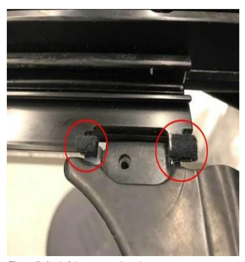
Figure 7. Apply felt tape on points shown.

6. Reinstall the bolts to the roller shade and apply thread locker and torque to 3Nm.