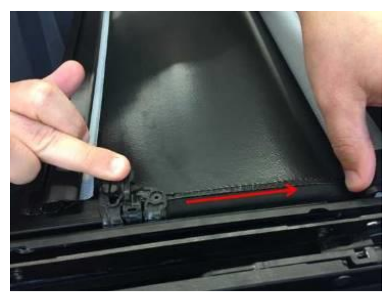
Figure 2. Loosening the roller shade.

Loosen the roller shade from the drive cable and push the material back until the bolts are exposed, then remove the bolts completely (Figure 2 and 3).