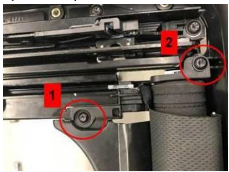
Figure 3. Remove the bolts.