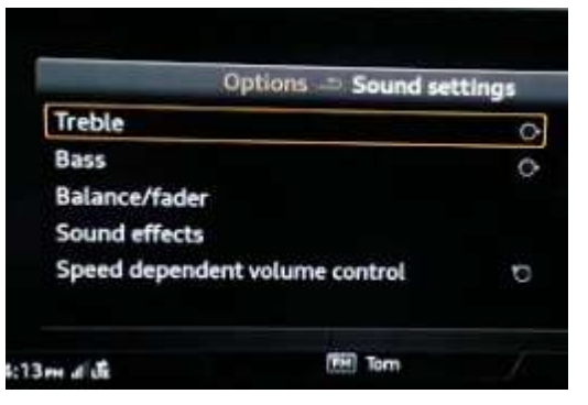
Figure 1. Sound settings is missing the subwoofer option.

The subwoofer adjustment is missing in the MMI for vehicles equipped with Bang & Olufsen (PR Code 9VS) and the customer vehicle has MMI Navigation (PR Code I8H & I8L) (Figure 1).