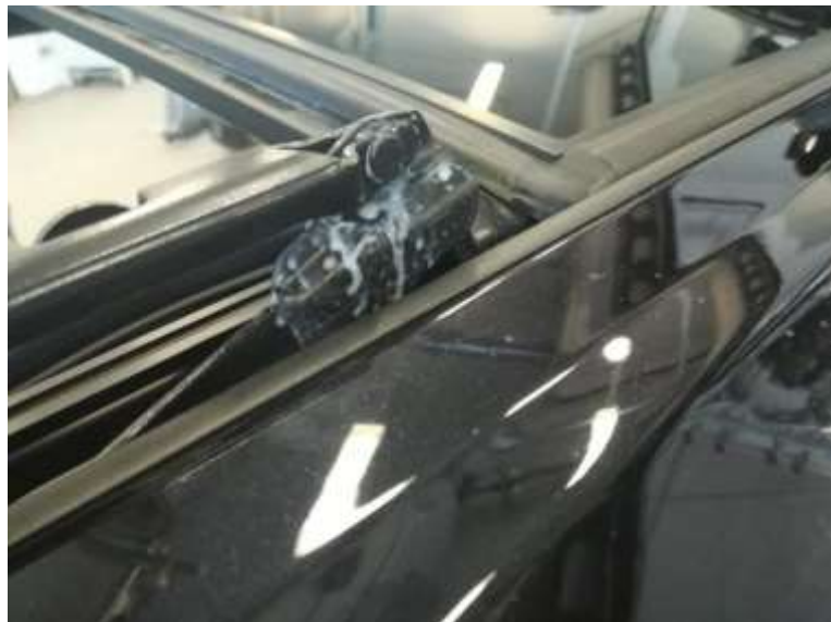
Figure 8. Bracket after lubrication.