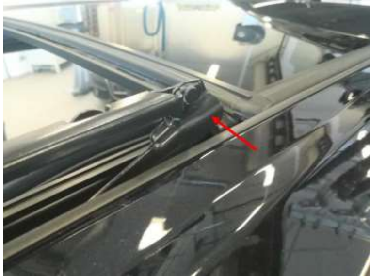
Figure 7. Section of slide and tilt mechanism to be lubricated.