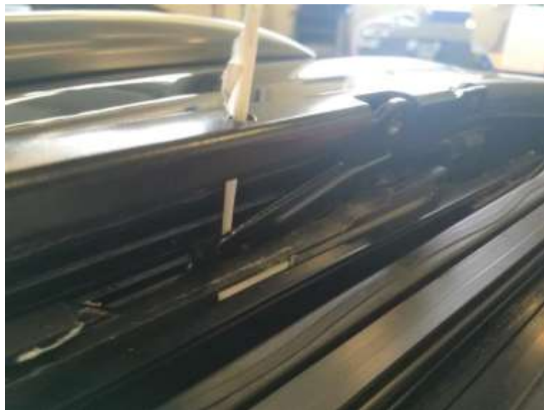
Figure 10. Close up view of the lubrication of the channel under the arm of the slide and tilt mechanism.