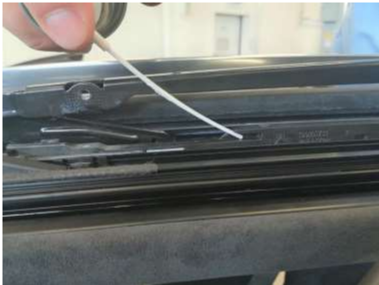
6. Lubricating the groove in the slide and tilt mechanism.