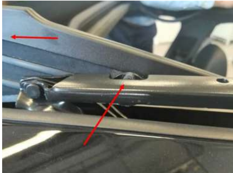
Figure 3. Left side of slide and tilt mechanism.