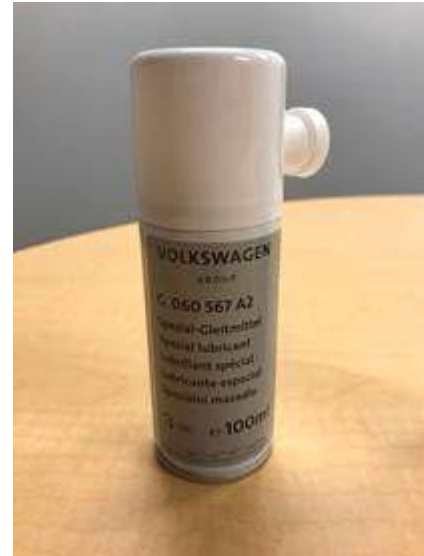
Figure 2. Special lubricant: G 060 567 A2.