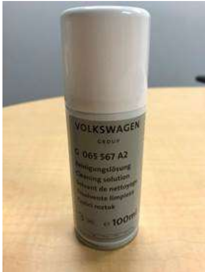
Figure 1. All purpose cleaner: G 065 567 A2.