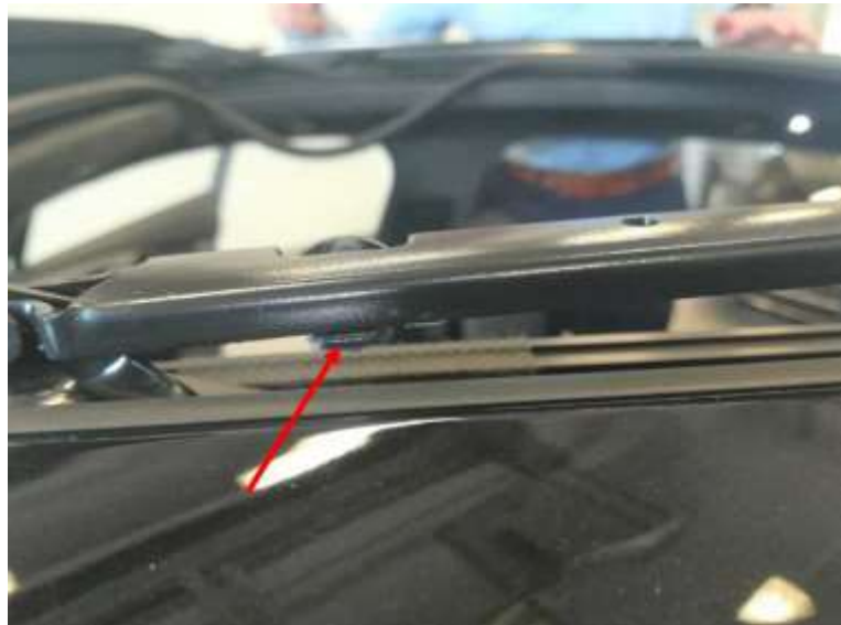
Figure 4. Lug to be lubricated on slide and tilt mechanism.