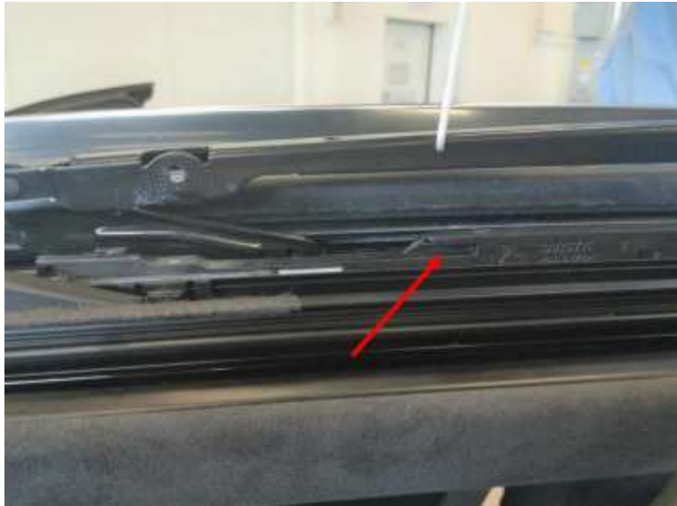
Figure 5. Groove in the slide and tilt mechanism.