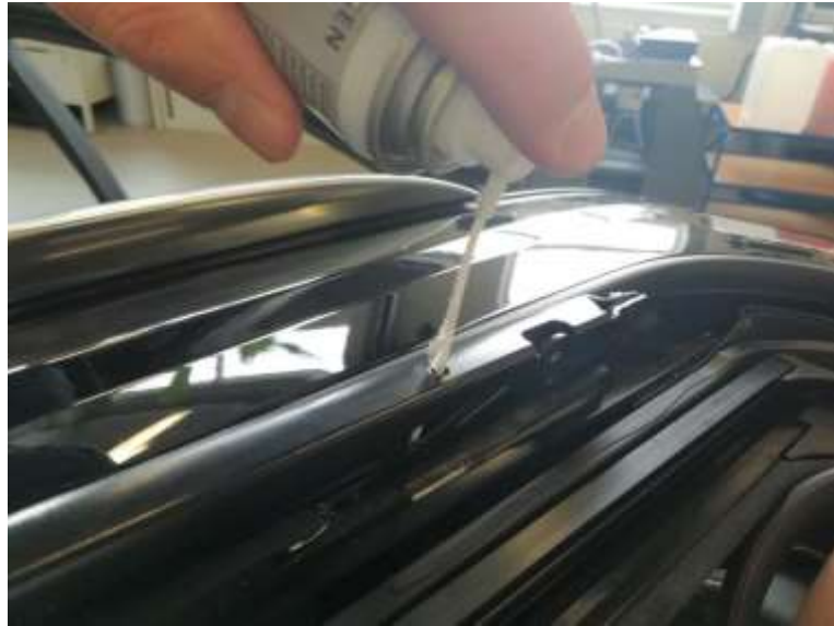
Figure 9. Accessing the channel through the arm of the slide and tilt mechanism.