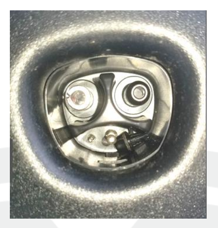
Figure 5 (Dislodged pin deadfront at lower right)

7. Inspect the charge port for any broken or dislodged pin deadfronts and remove them with needle nose pliers (Figure 5).