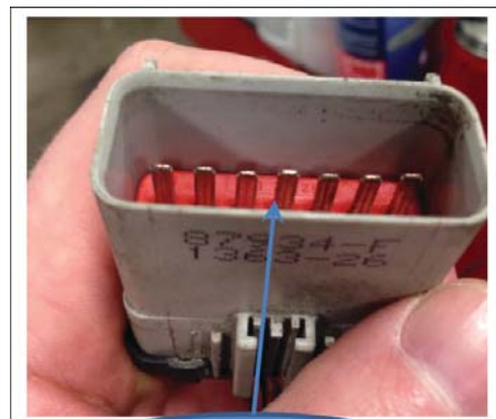
First inspection-the connector looks OK

1. Inspect the electrical circuit connections between the ACM and the DEF pump at the DEF pump connector, ACM connector, and FCUT connector. Pay special attention to the FCUT connector. A minor amount of oxidation or corrosion will cause these DTCs.