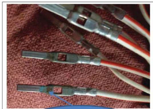
After removing the red retainer, corrosion is seen present in the connector.