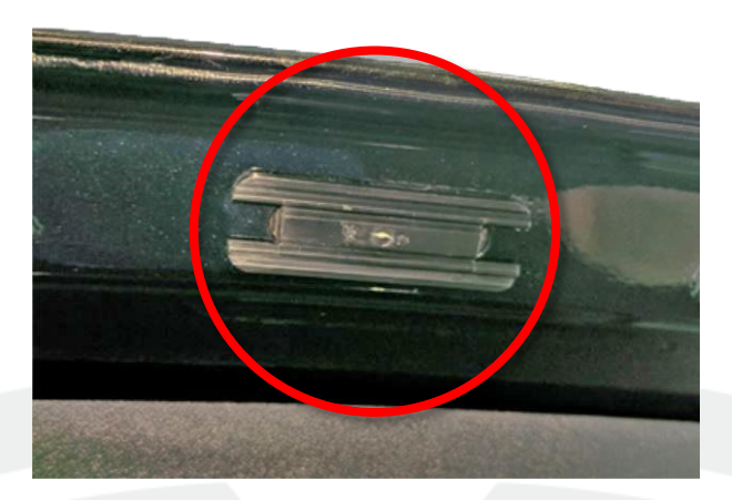
Figure 2 (Updated drain-type LH liftgate plug installed, RH similar)

5. Install the updated drain-type LH and RH liftgate plugs (Figure 2). Make sure that they are fully seated.