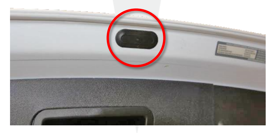
Figure 1 (Original LH liftgate plug, RH similar)

4. Clean the area around the LH and RH liftgate plugs using an IPA wipe.