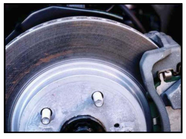
Figure 1. Slight Rust on Rotor (Easy to Remove by Braking)