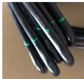
Green Dot - Use