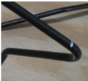
White Dot – Do Not Use