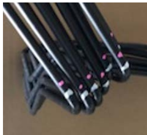
White and Pink Dots – Use