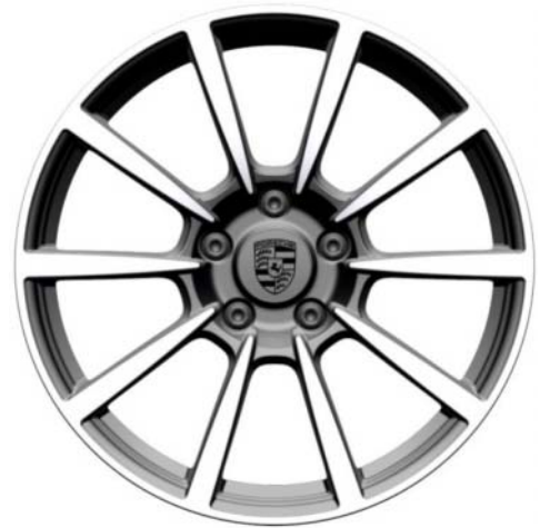
20-inch Carrera Classic 2