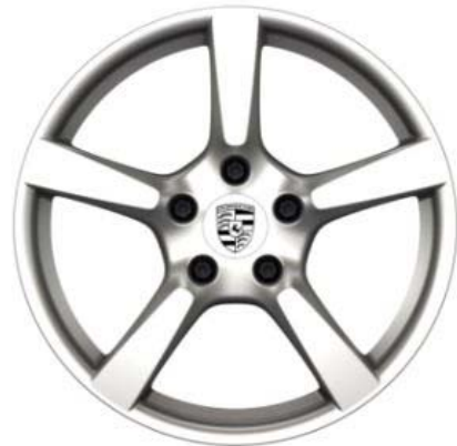
19-inch Cayman S 4

RA: 10J x 19, RO 45 Part No. 982.601.025.C_FFF