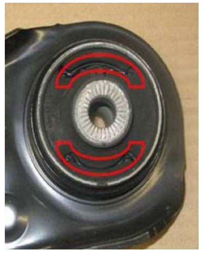
Figure 3. Lithium grease is applied on the red highlighted area only.

The lithium grease must only be applied to the areas shown in red (Figure 3).