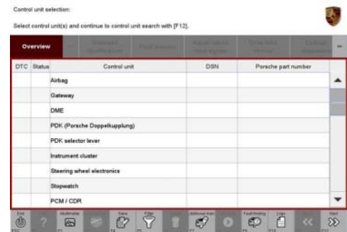
Control unit selection