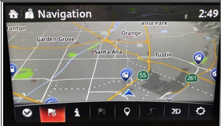
BHP1-66-EZ1G or later example is shown

Only Shell fuel station icons will be shown on the map