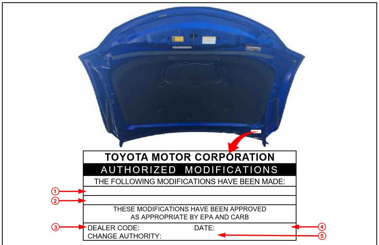
Figure 1. Location of Authorized Modifications Label on 2016 – 2017 GS200t, RC200t, and RX350, and 2016 – 2018 GS350, RC300, and RC350