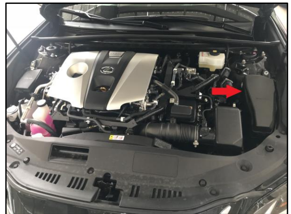
Figure 2. Engine Room Relay Block Location