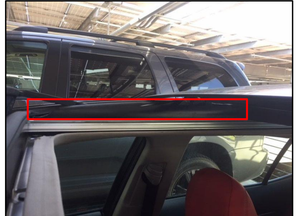
Figure 1. Side Garnish

Removal of the side garnish will assist with removal and installation steps.