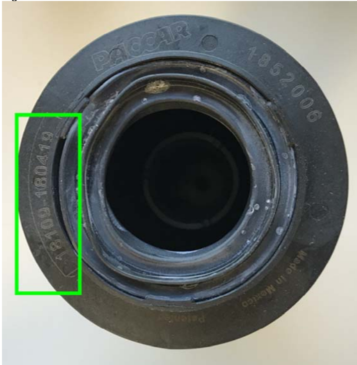
Figure 1 Date Code Location

Elements with date code 18141 or later are not suspect.