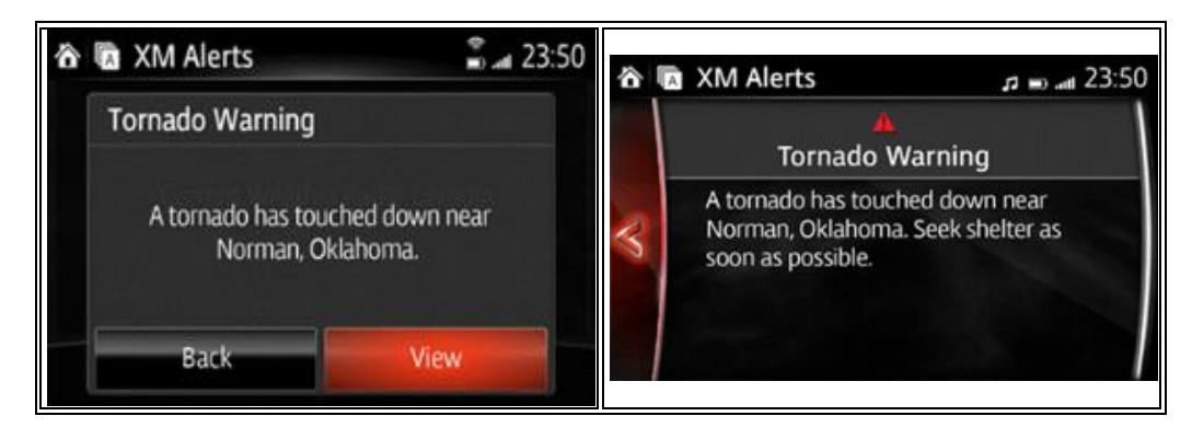
Page 2 of 3

When severe weather occurs in the vicinity of the own vehicle position, a warning and detailed information via a pop-up screen.