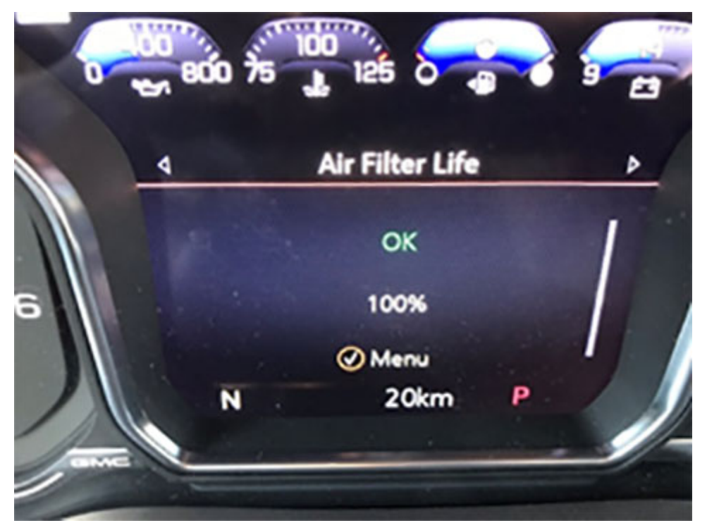
This PI will be deleted when a when the calibration is released. Then a bulletin will be developed.