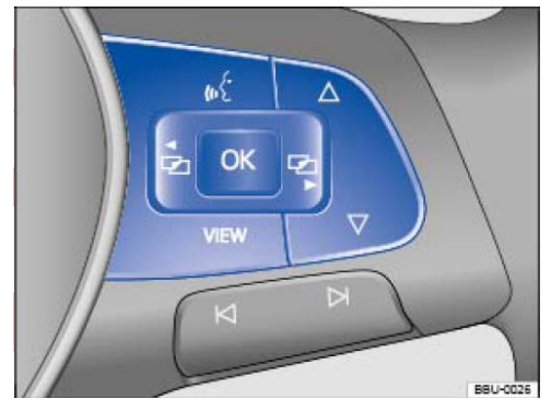
Figure 1: Right side of the multi-function steering wheel: Controls for the menus and information in the instrument cluster display.