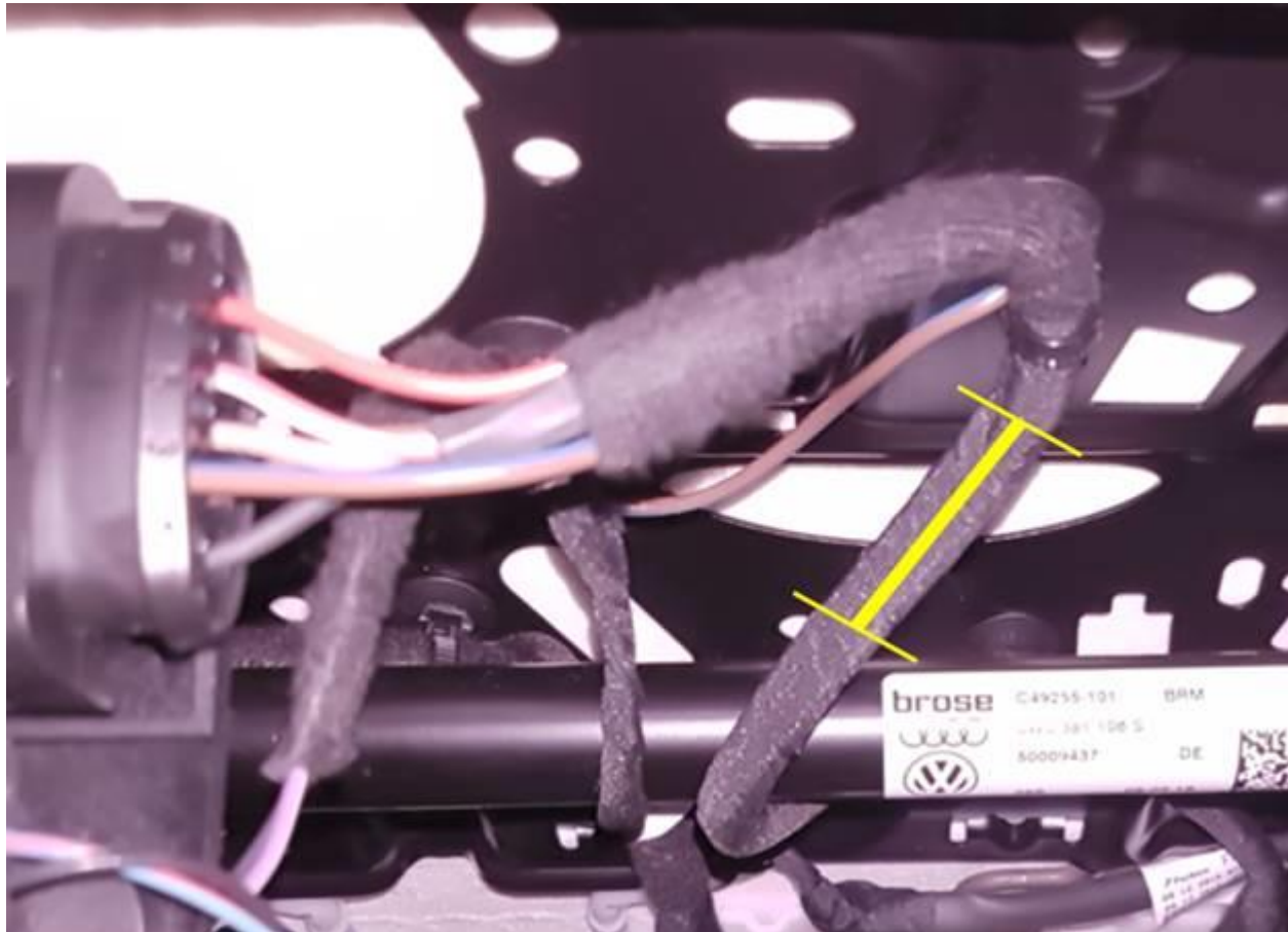
Figure 2. Attach the first cable tie in the yellow area.