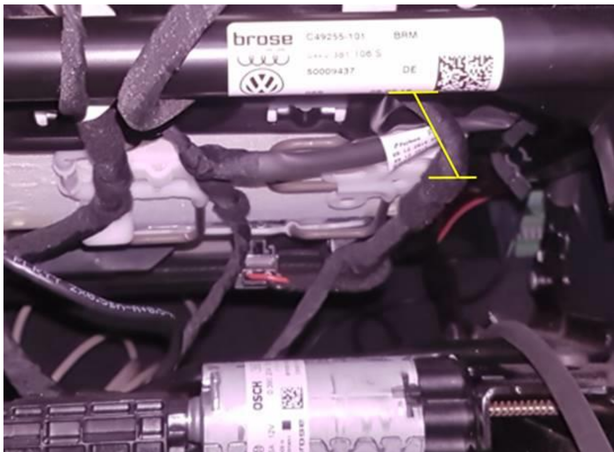
Figure 3. Attach the second cable tie to the yellow marked area.