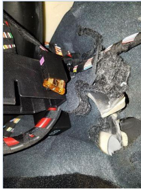
Figure 3: Fuse S250 improper installation example