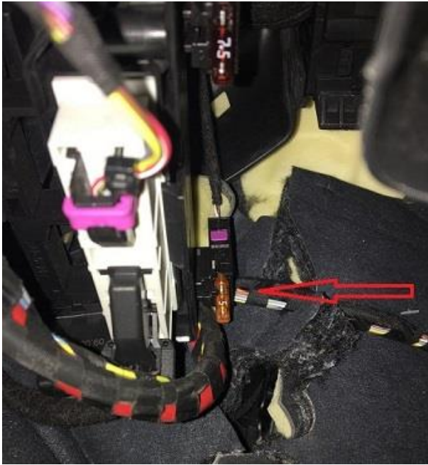
Figure 2: Fuse S250 Location