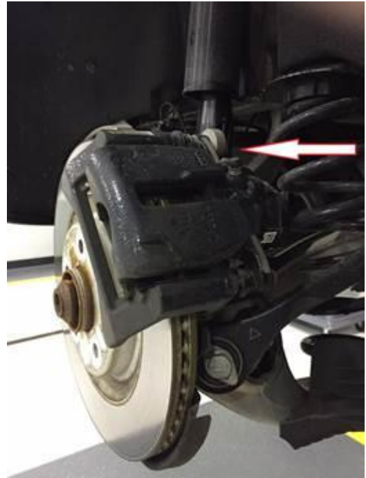
Figure 4. Balance weight position.

The balance weight should be assembled in the upper position near the parking brake electric motor connector (Figure 4).