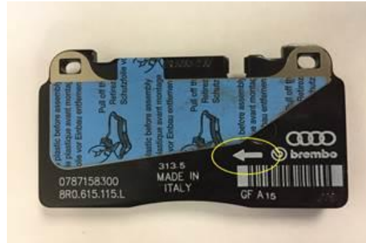
Figure 2. Directional arrow on the back of front brake pad.

The following steps must be followed to ensure proper installation of the pads: