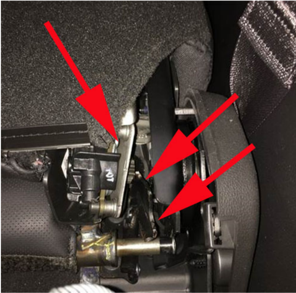
Example of damaged frame shown above.