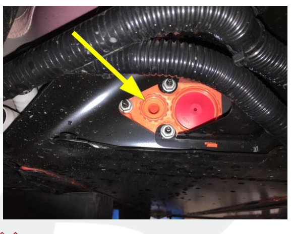
Kigure 2 (LH vent shroud without breather)