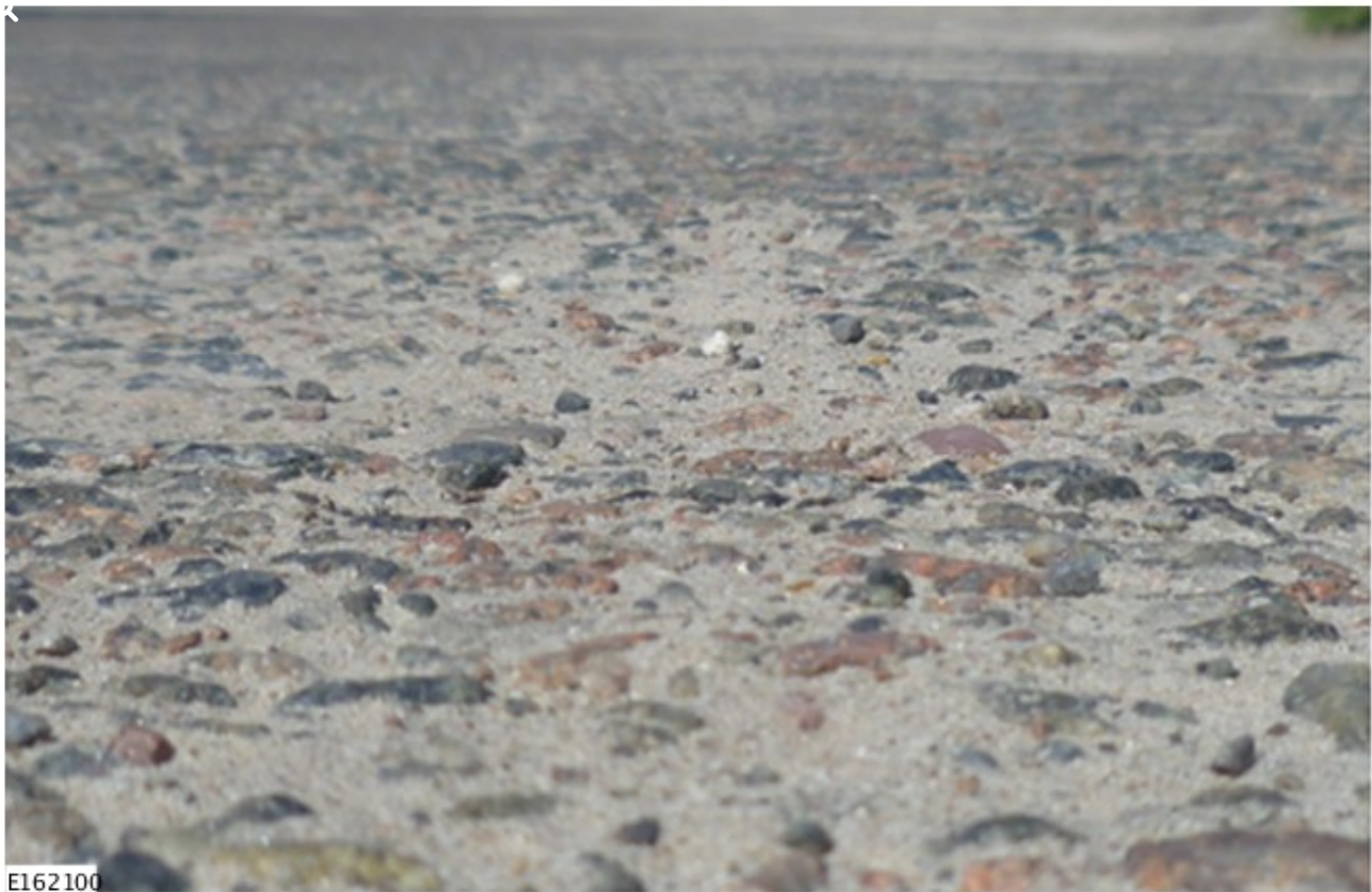
Typical road surface that can generate the rattle sound.