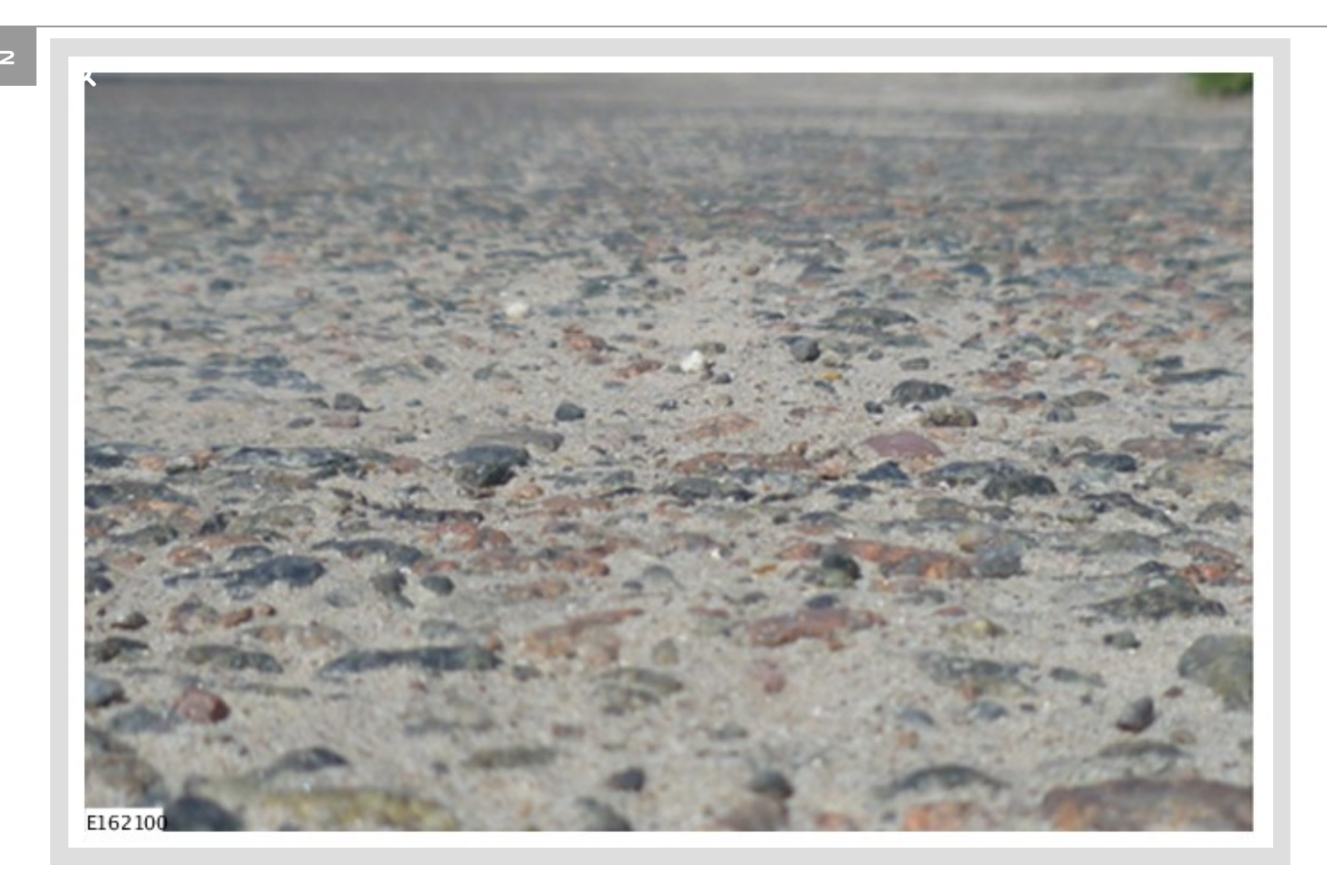
Typical road surface that can generate the rattle sound.