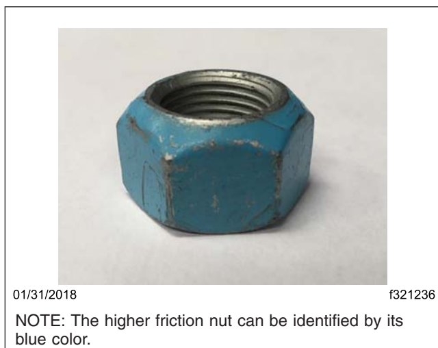
Fig. 1, New High Friction Nut

Tighten the fifth wheel M16 fasteners from the bolt head to 170 \pm 12 lbf-ft ( 230 \pm 16 N-m).