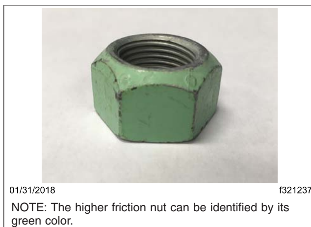
Fig. 1, New High Friction Nut

Tighten the rear-suspension (bogie) crossmember 3/4–16 fasteners from the bolt head to 266 ± 19 lbf-ft (360 ± 25 N·m). See Fig. 2 .