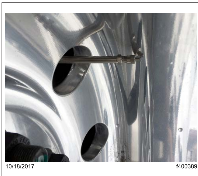
Fig. 1, Valve Stem Stabilizer is Missing