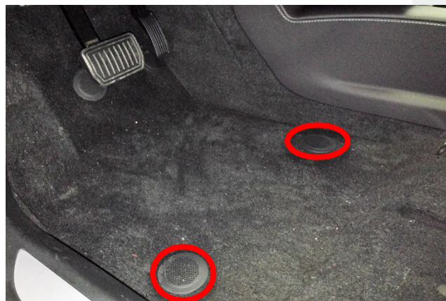
Figure 1 (Driver side floor mat anchors)