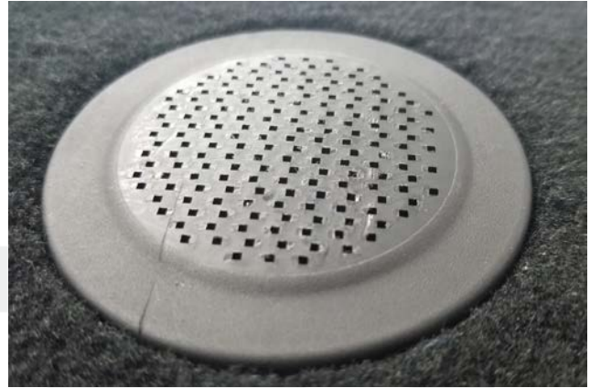
Figure 4 (Anchor surface smooth)