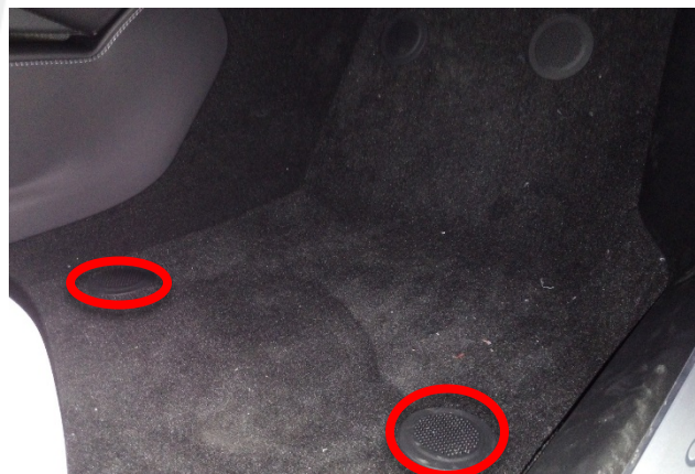
Figure 2 (Passenger side floor mat anchors)