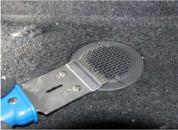
Figure 3 (Removing molded hooks)