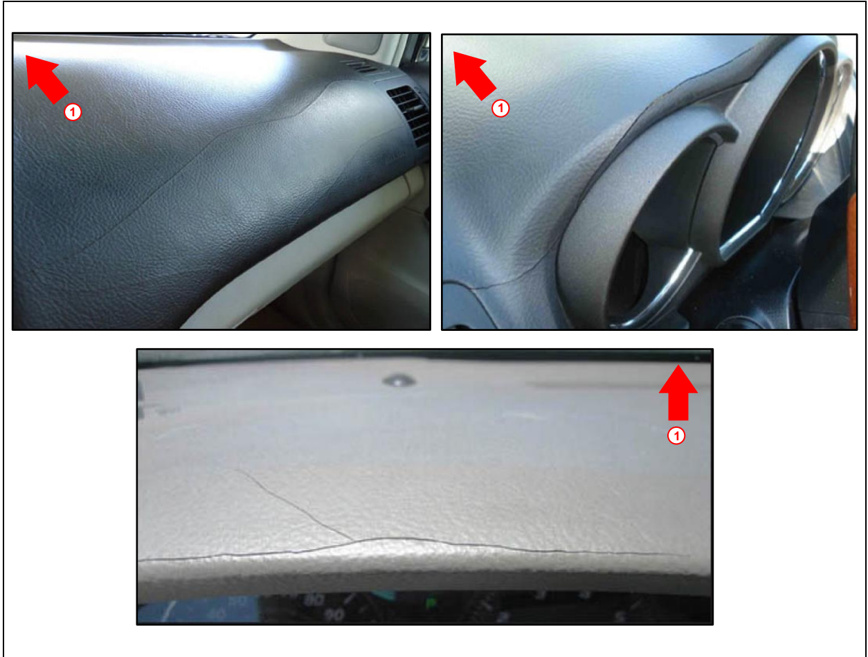
Figure 3. Example of Cracked Condition