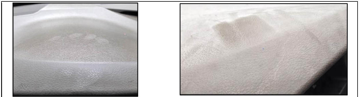
Figure 2. Example of Chalky Condition (Becomes Sticky)