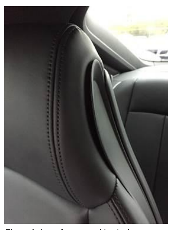
Figure 2. Inner front seat side trim loose.