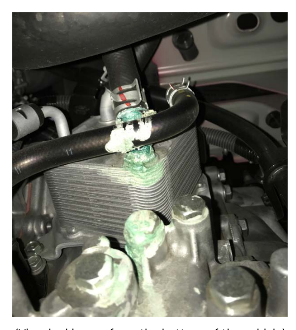
(View looking up from the bottom of the vehicle)

Dealers have reported coolant leaking from the water hoses at the CVT8 fluid cooler (see photo below). Normal dealer repairs have been to replace the water hose and/or clamps on the affected area.