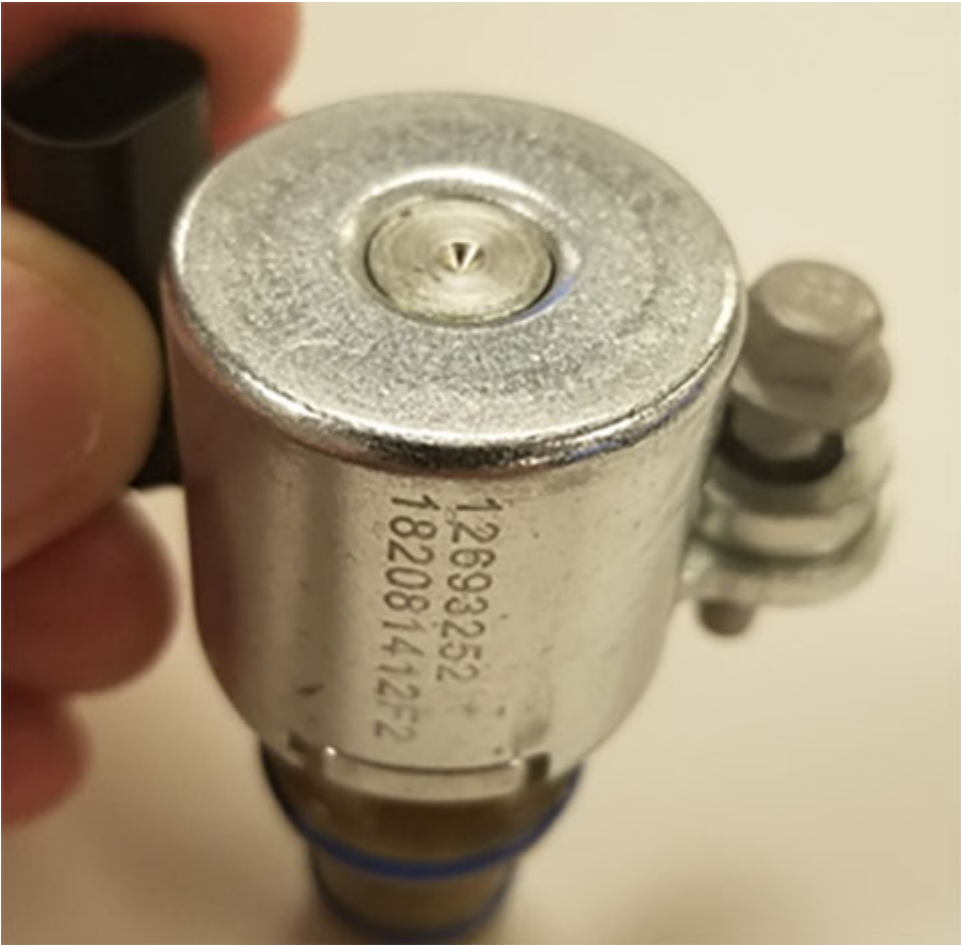
3 Images above show measuring the plunger of the OCV. (It should be checked in the vehicle)

Note: This is a preliminary temporary diagnostic and repair. As more investigation information becomes available this PI will be updated or advanced to a bulletin.