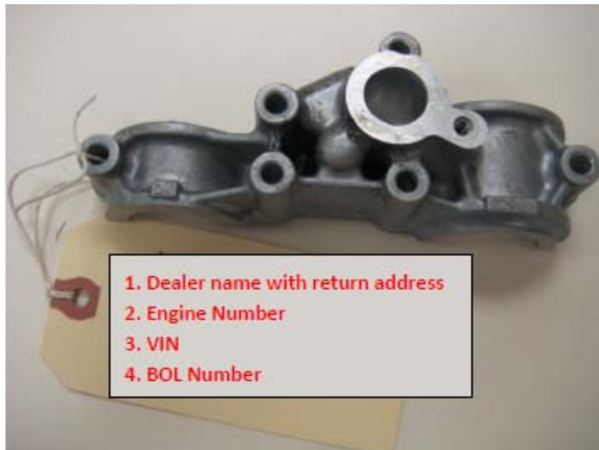
Figure 1 – Front camshaft bearing cap

Maserati Quattroporte and GranTurismo vehicles with wet sump engine, with an engine number prior to 148697, may be affected by two different types of timing variator noise. In the event of a customer complaint of the noise from variator at cold start or when releasing the throttle in above mentioned vehicles, verify the engine number and follow the flow chart shown on following page.