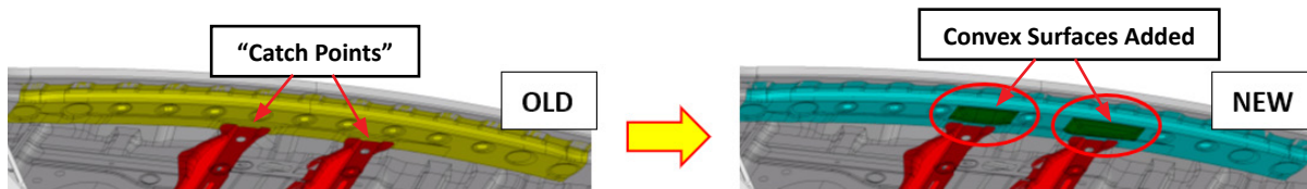
View from inside trunk area looking upward toward underside of package shelf.

This Service Information bulletin advises of a design change made to the rear body panel. This panel is located between the trunk and the rear glass and incorporates the package shelf. It has been re-designed with 2 convex surfaces added to prevent items going into or out of the trunk from being scratched or caught by the rear edges of the reinforcement panels (shown in red) on the illustrations below.