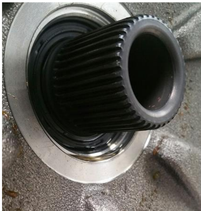
Figure 2. Oil leak at the input shaft.