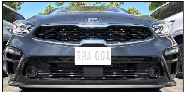
Plate Installed Correctly (with bracket and is not blocking SCC radar)