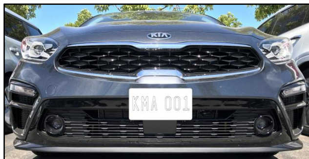
Plate Installed Incorrectly (without bracket and is blocking SCC radar)